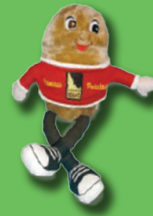
Spuddy Buddy 10 each month

The sooner you play the game, the more prizes you're eligible to win!