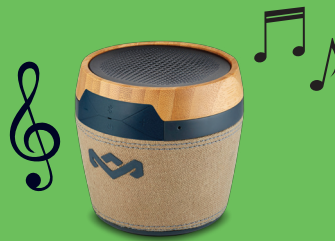
Bluetooth speaker 10 each month