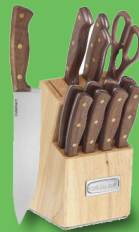
Cuisinart knife set 10 each month